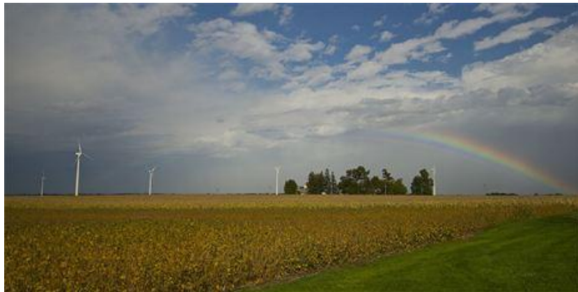
Ride the Rainbow